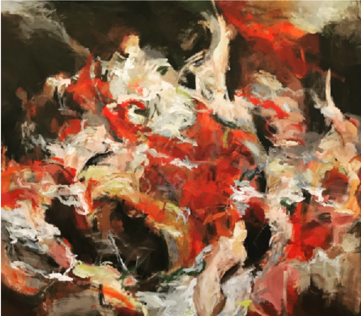
La Fête 165cm x 165cm SOLD

We always aim for the big celebrations. Forgetting that it is the little ones that get us there.