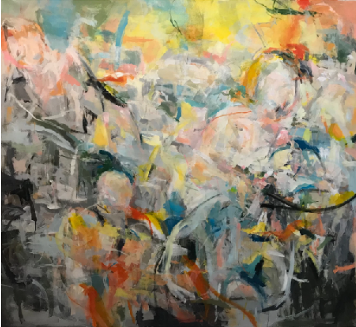
Real Talk 165cm x 165cm

Only over time do we learn that the more perfect we try to make something, the less perfect it seems.